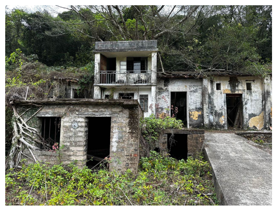
The team was introduced to Fuk On Kui, a series of houses illustrating the integration of modern house style with traditional houses, within one clan.

Re-telling the Yung Shue Au Story – Appendix 1 of 2<sup>nd</sup> Progress Report