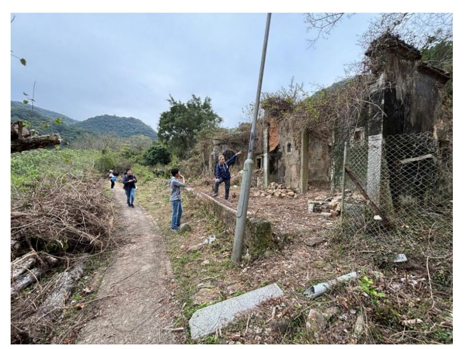
The village head of YSA guided the CUHK team to significant buildings. Here explain the use of the previous village council.